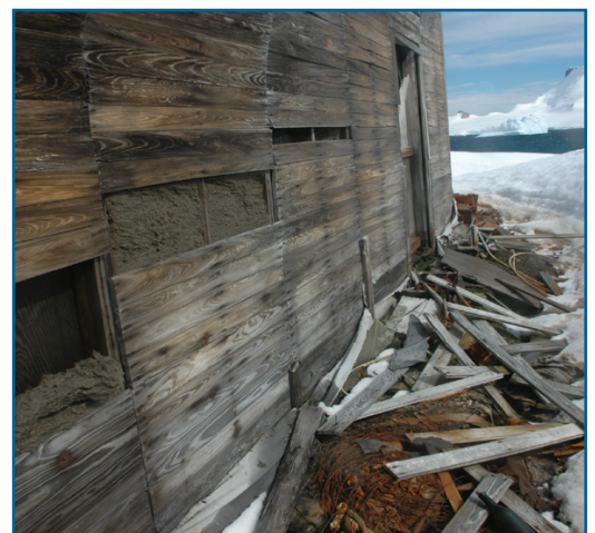
The side of the bunk house at East Base