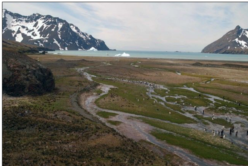
View towards Fortuna Bay showing braided river