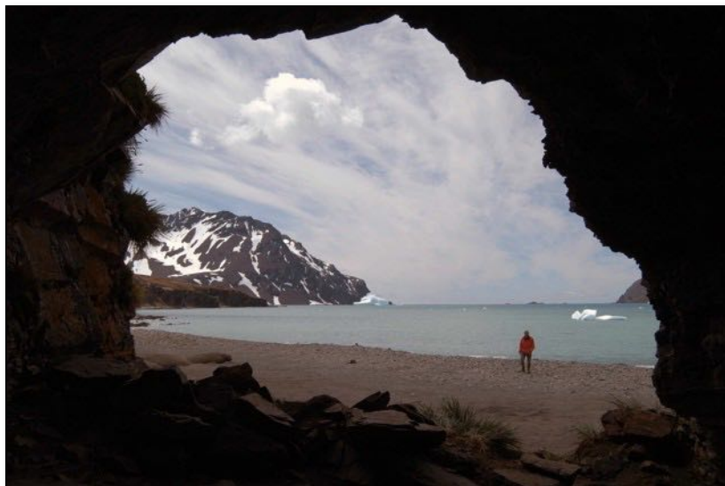
View from sealers cave. Be careful not to disturb the rockwall.

Beach area between Whistle Cove and the large river outlet midway along the head of the bay.