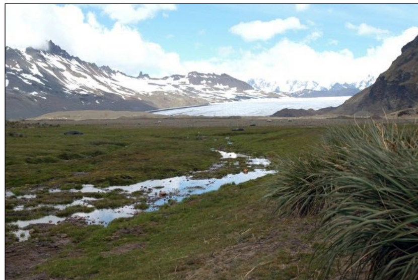
View towards king penguin colony and König Glacier