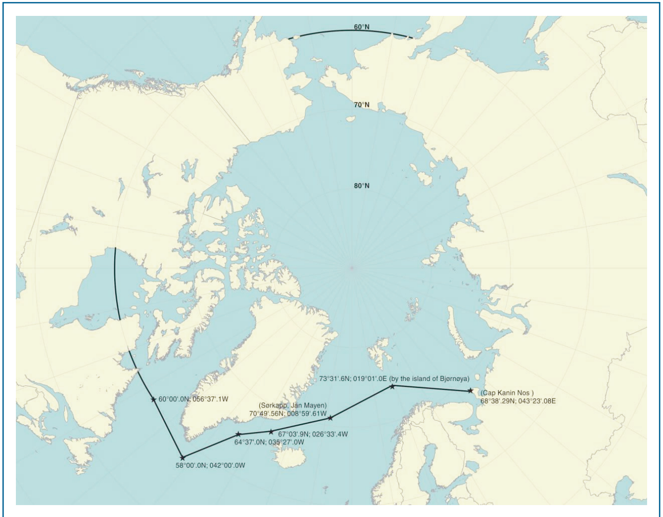
Figure 2 – Maximum extent of Arctic waters application 3