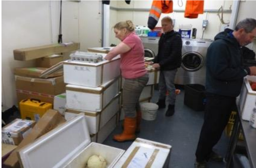
Figure 8. Checking fresh produce in the biosecurity shed at King Edward Point

At King Edward Point and Grytviken, produce should be taken to the biosecurity shed (Fig. 8) which is equipped with crawling insect traps and UV flying insect traps. At Bird Island, produce should be kept in sealed containers and taken to the kitchen. The kitchen should be equipped with flying and crawling invertebrate traps.