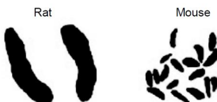
Rat & mouse faeces

Remain vigilant to the presence of rodents on board ship, including the presence of faeces, gnaw or chew marks, damage to provisions or suspected sightings. Ensure well-fitting rodent guards are fitted to mooring lines at gateway ports prior to arrival in SGSSI.