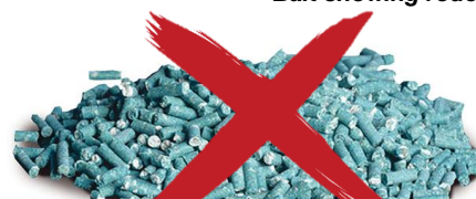
LOOSE BAIT PELLETS

If you have bait boxes already on board from previous visits to SGSSI, please check that the bait is intact and in good condition prior to departing for SGSSI. At a minimum, bait should be replaced annually or if the bait becomes damp or damaged. Bait will deteriorate more rapidly in wet locations than in dry sites. Dispose of old bait blocks by incineration or in landfill.