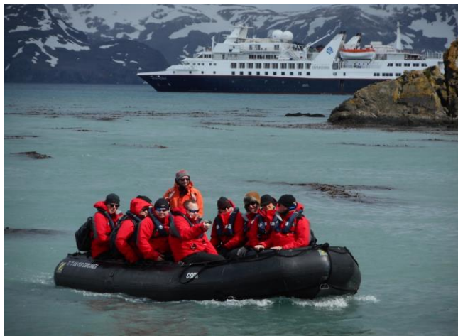
Figure 3. Example of a zodiac being used to support visitors