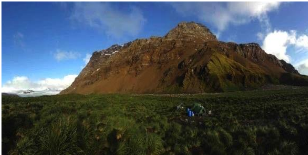
Figure 4. Camping equipment presents a particular biosecurity risk

Activities that involve visitors spending a large amount of time ashore such as during science or media projects, overnight trips undertaken by mountaineering expeditions or by personnel based at King Edward Point, present an increased biosecurity risk (Fig. 4).