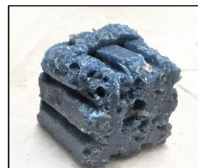
Bait showing rodent gnaw marks

Rodent monitoring stations contain solid wax bait blocks impregnated with rodenticide (0.005% Difenacoum). GSGSSI requires the use of solid wax bait blocks to enable checks of the bait to show gnaw marks or unexplained damage to the wax block which may indicate the presence of rodents. Any such marks must be reported to GSGSSI before entry into the maritime zone. Loose bait such as pellets cannot be used as is it will not show any signs of disturbance by rodents.