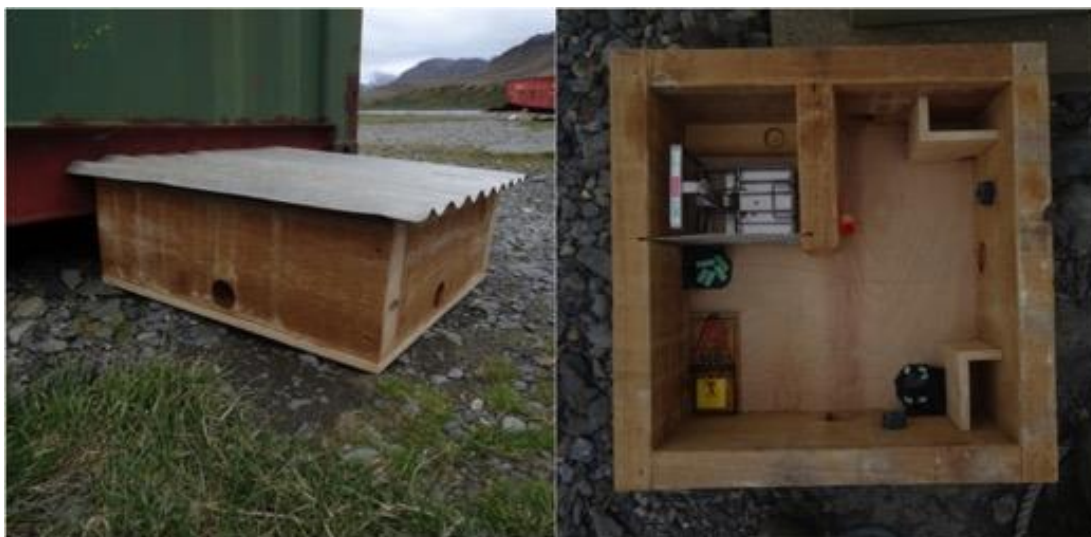
Figure 9. Rat hotels have a DOC 200 trap, mouse traps, wax tags, poison bait (formulated for rats and mice) and a poison bait block