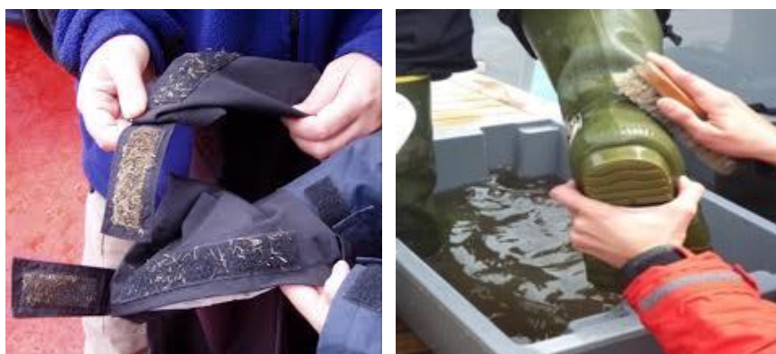
Figure 2. Checks to undertake before first landing on SGSSI

NOTE: Government Officers will inspect boot washing facilities and procedures on visiting vessels (including yachts) and will inspect visitors, including staff and crew before they disembark the vessel to ensure biosecurity protocols have been undertaken properly.