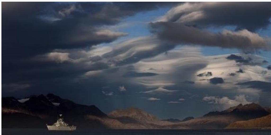
Figure 6. HMS Clyde in Cumberland Bay

Royal Navy vessels visit the Territory and undertake a range of tasks. A range of Royal Navy vessels visit the Territory throughout the year but the most common visitor is the South Atlantic patrol ship HMS Clyde (Fig. 7)