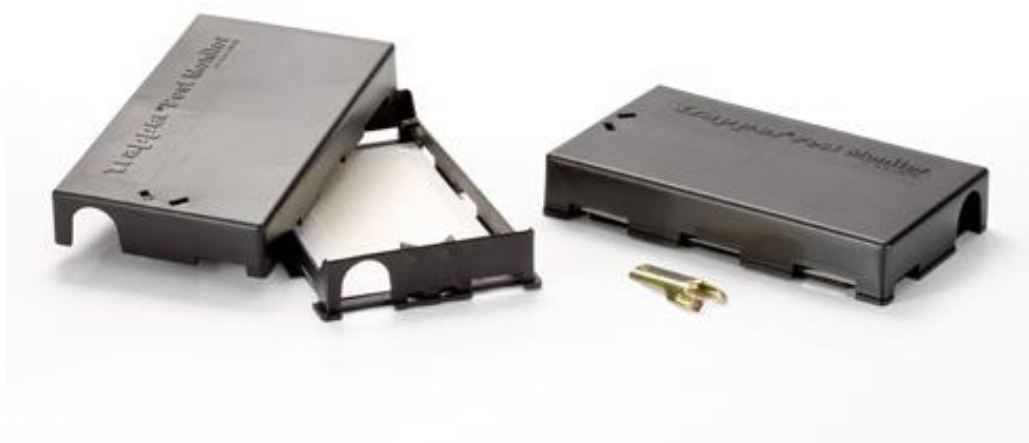
Figure 10. Sticky traps used to monitor for invertebrates and mice