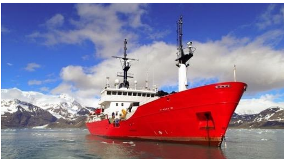
Figure 5. Pharos SG the GSGSSI fisheries patrol vessel