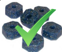
SOLID WAX BAIT BLOCKS