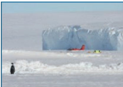
Camp site near iceberg at emperor penguin colony