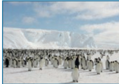
Emperor penguin colony in good weather