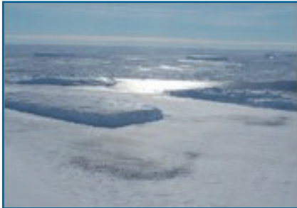
Aerial view of emperor penguin colony