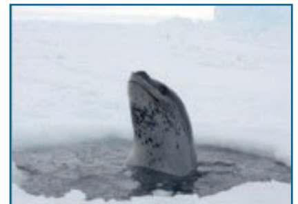
Leopard seal at breathing hole