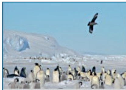
South polar skua overflying colony