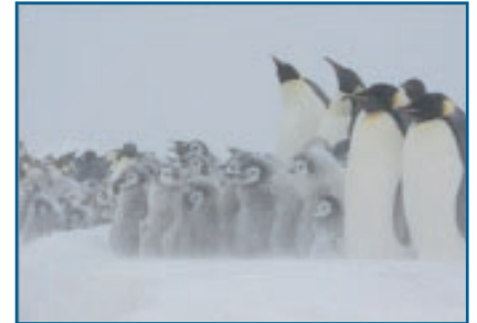
Emperor penguin colony in poor weather