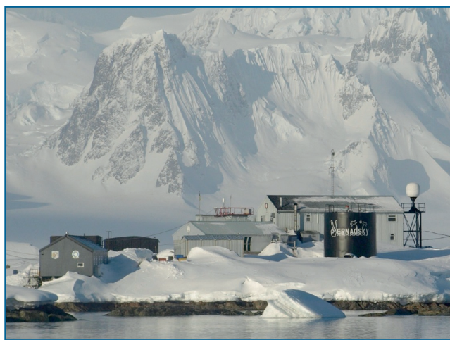
Vernadsky station general view