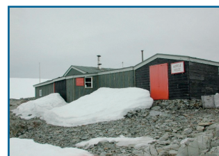
Historic British Base F, Wordie House