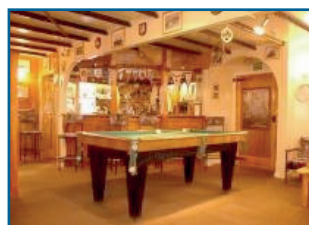
The Faraday bar