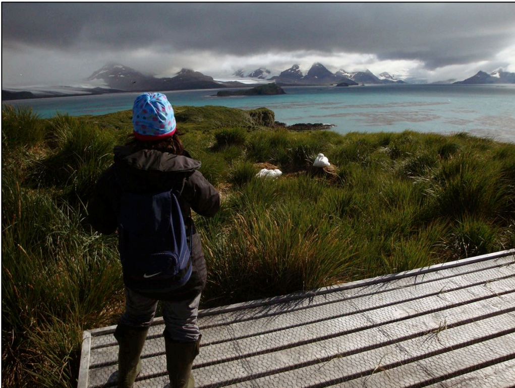
Upper viewing platform

Whilst on the boardwalk, visitors must proceed directly and quietly to the viewing platforms.