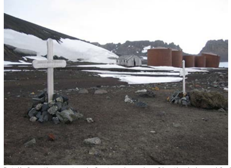
Details from the cemetery in front, and remains of hunting lodge and fuel tanks in the back.