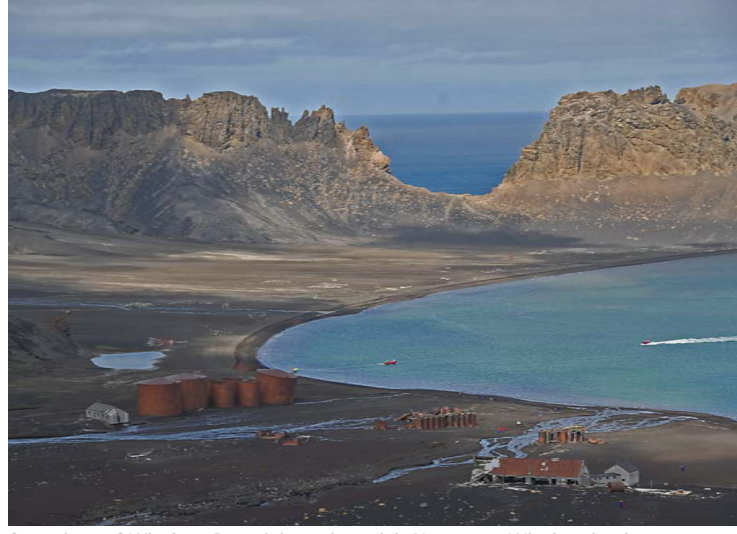
Overview of Whalers Bay visitor site with Neptunes Window in the background.