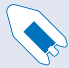
Landing and Transport Requirements