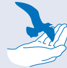
Respecting Protected Areas