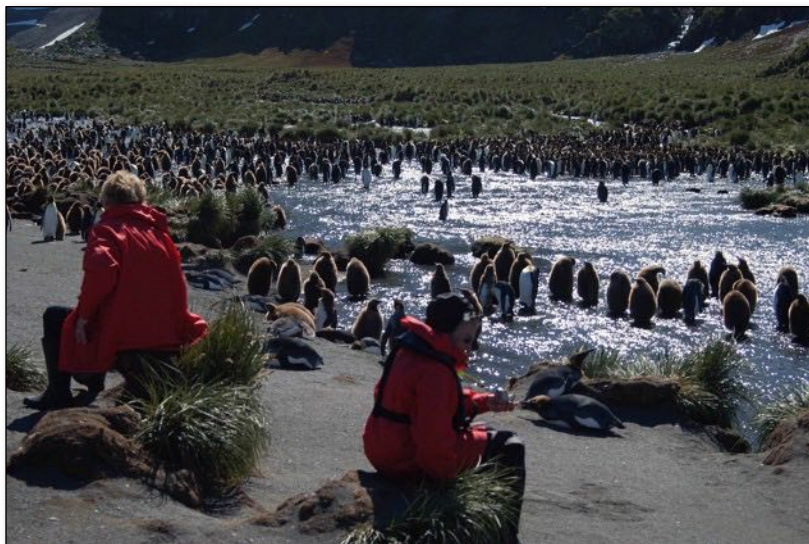
Near the edge of the colony