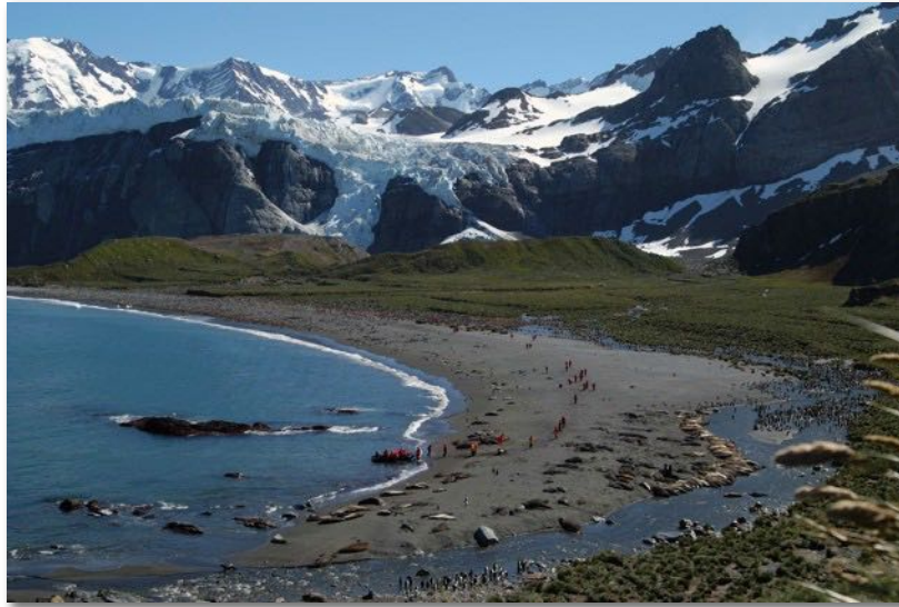
Gold Harbour landing site