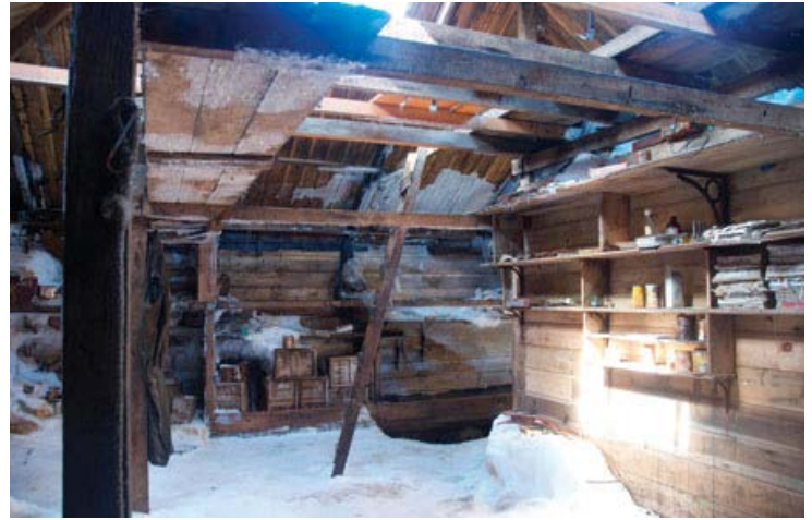
Interior of Main Hut.