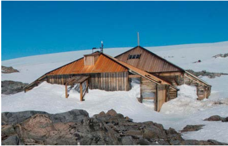
Main Hut.