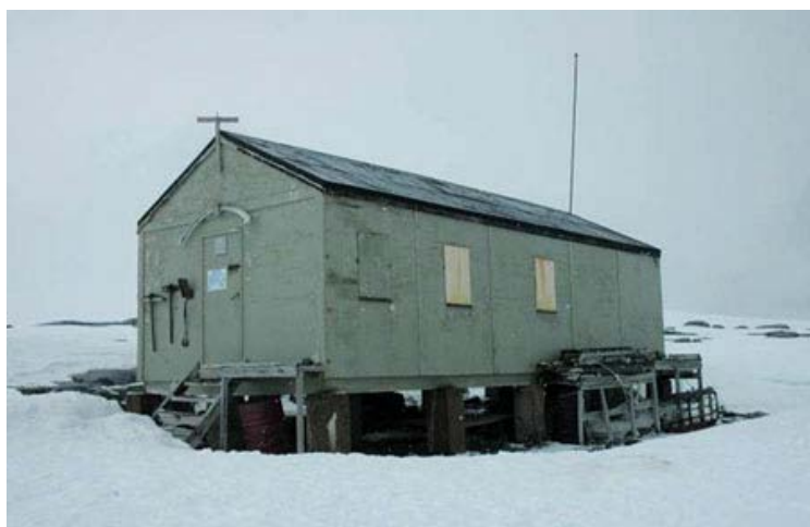
Damoy Hut (UK), Historic Site and Monument No 84