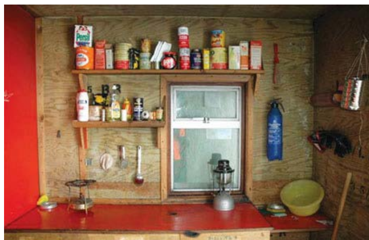
Interior of Damoy Hut Historic Site and Monument No 84