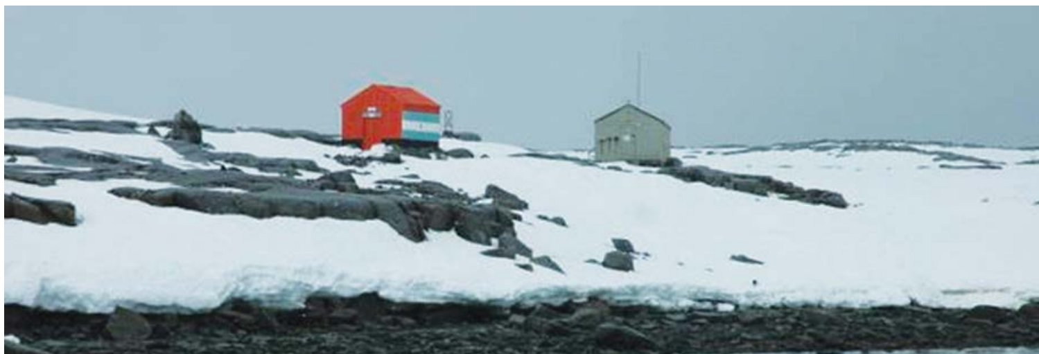
Shoreline of Dorian Bay showing the preferred landing site and the Argentine and UK huts in the background