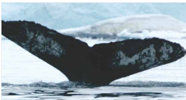
AHWC-3019