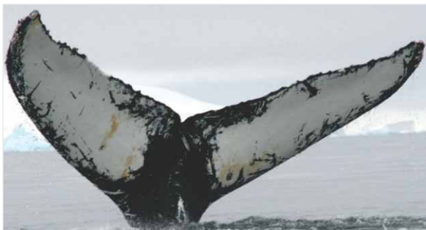
AHWC-3227