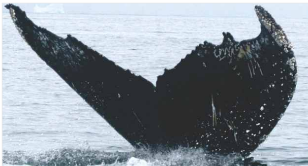
AHWC-3267