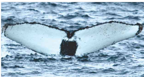
AHWC-3328