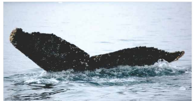
AHWC-3263