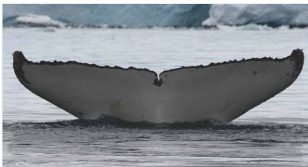
AHWC-3247