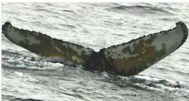
AHWC-3445