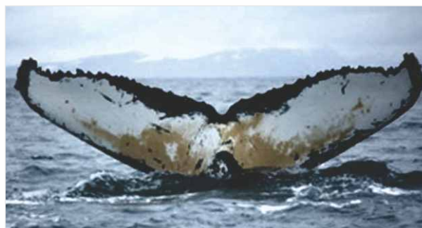
AHWC-4861