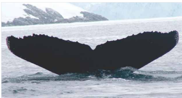
AHWC-3271