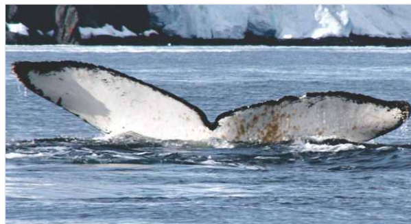
AHWC-0456