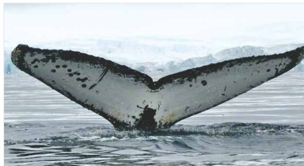
AHWC-3228