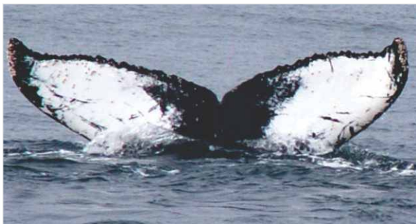
AHWC-3268