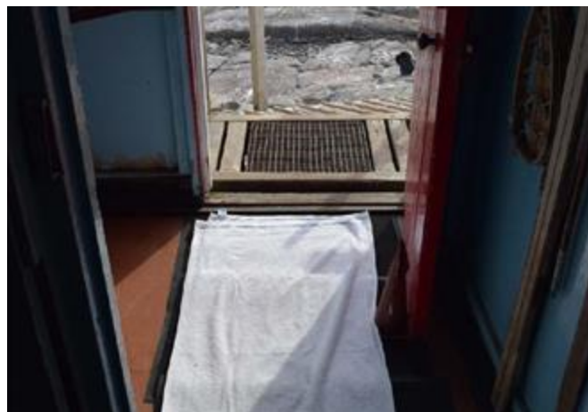
A towel on the porch to help keep the floors dry