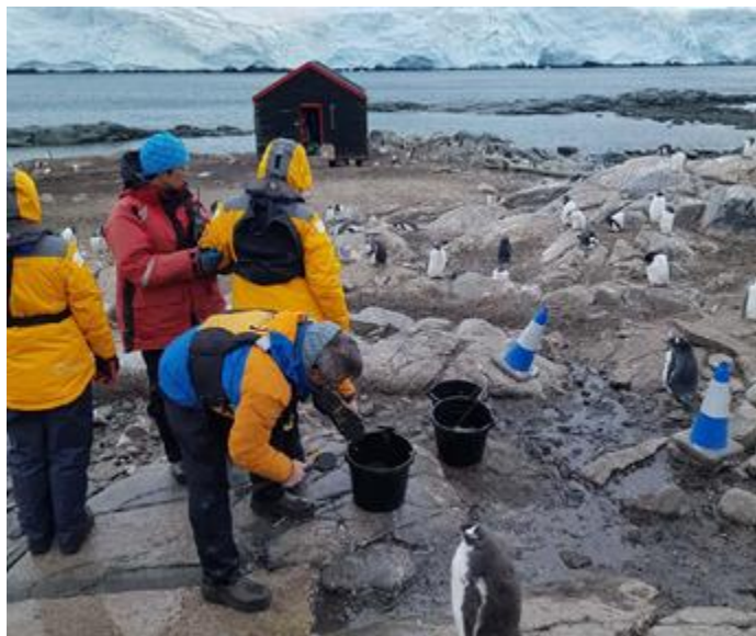
Expedition team cleaning boots before entry

Please bring fresh water for your guests to rinse their boots before they enter Bransfield House and some clean towels for the porch to help keep the museum floors in good condition. If it is a wet day when you visit, please bring along extra towels so that you can clean and dry the floors before you leave.