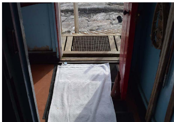
A towel on the porch to help keep the floors dry