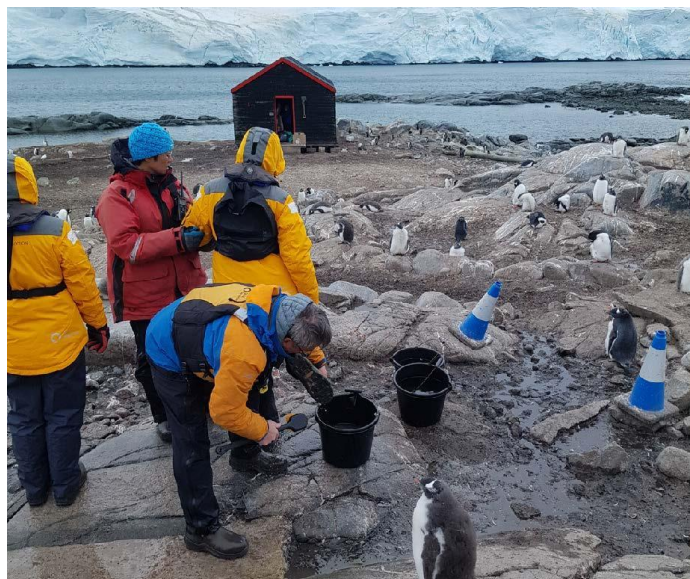
Expedition team cleaning boots before entry

Please bring fresh water for your guests to rinse their boots in before they enter Bransfield House and some clean towels for the porch to help keep the museum floors in good condition. If it is a wet day when you visit, please bring along extra towels so that you can clean and dry the floors before you leave.