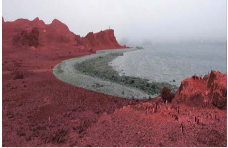
View to the site from South of Brailard Point, eastern area of the Northeast beach in Ardley Peninsula (Ardley Island). Entry into the ASPA (red area) is prohibited without a permit.