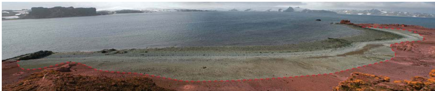
View to the site from Faro Hill. Entry into the ASPA (red area) is prohibited without a permit.

These huts should not be used, except in cases of emergency.