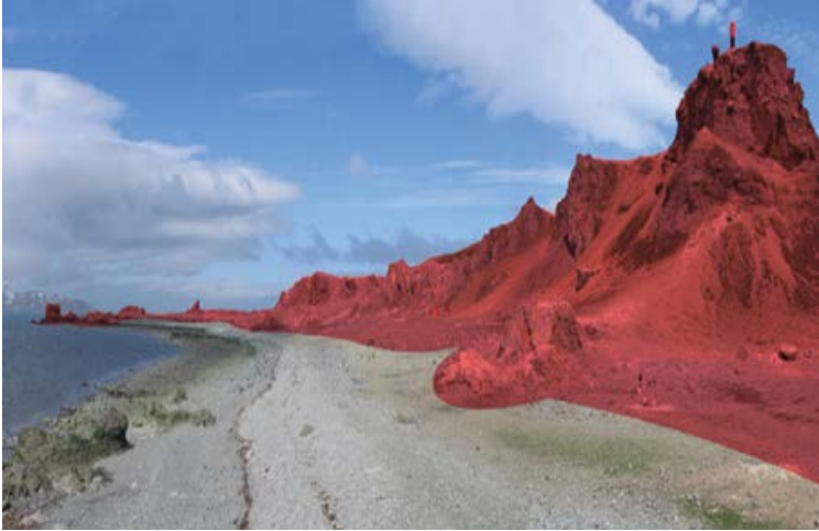
View to the site from Faro Point, the landing point to visit this site. Entry into the ASPA (red area) is prohibited without a permit.