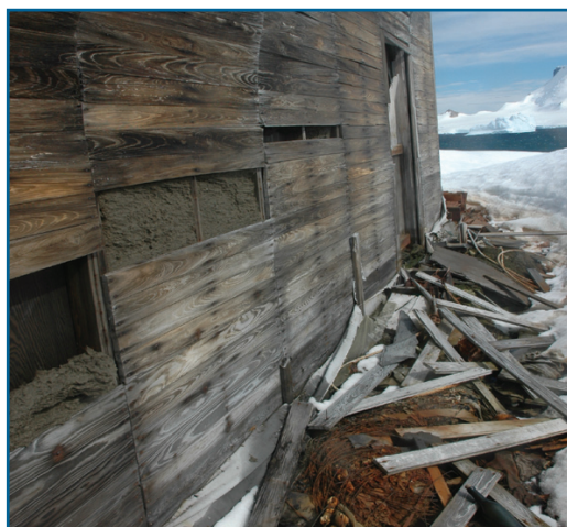
The side of the bunk house at East Base