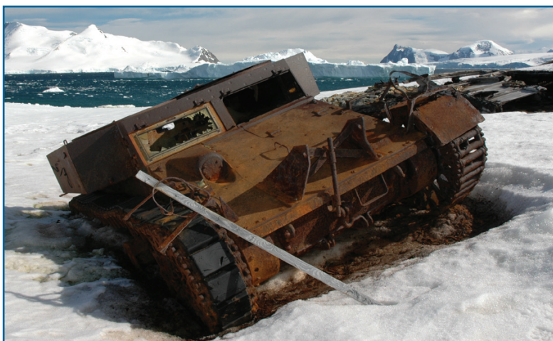
Light tank abandoned by East Base

Visitors may roam freely under close supervision.