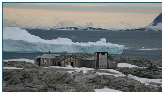
American East Base

Access to Base 'E' is limited to the main hut and the main generator shed at Base 'E'. Access is not permitted to any of the attached or associated structures, including the dog pens and jetty.