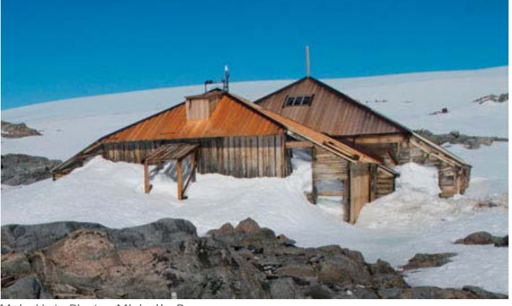
Main Hut.