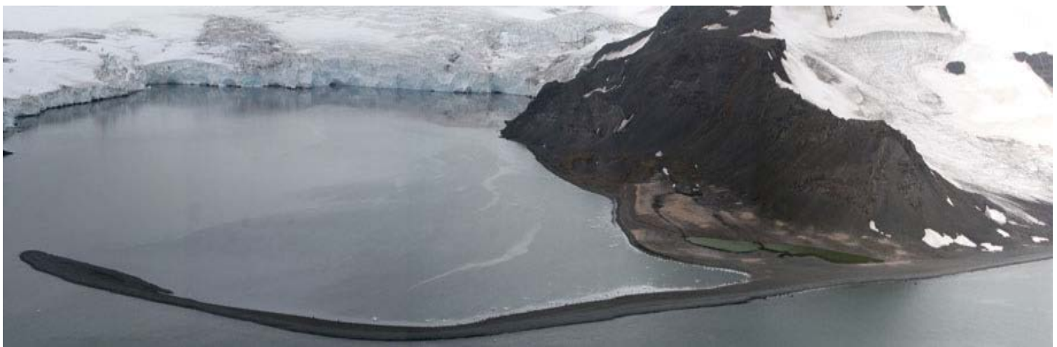
Yankee Harbour from above: showing the gravel spit enclosing the landing beach

Be aware that glacier calving may produce dangerous waves. Be aware that ice may be blown into the bay towards the landing site. It can move fast and end up blocking the landing site.