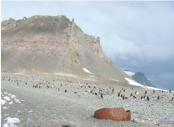
Artefacts from early sealing activities (a trypot) found on the inner shoreline