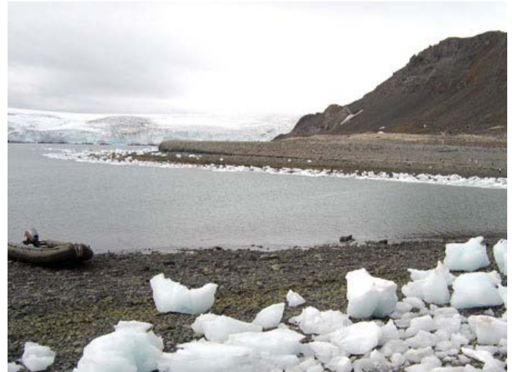
Yankee Harbour landing site