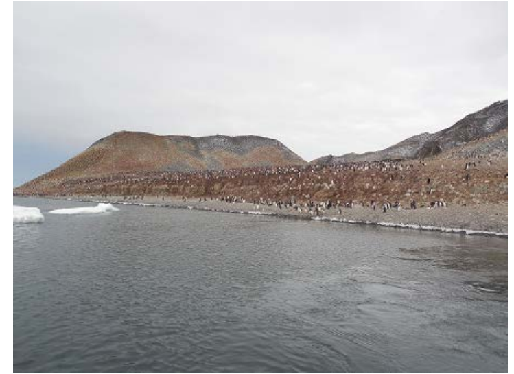
Northern landing area