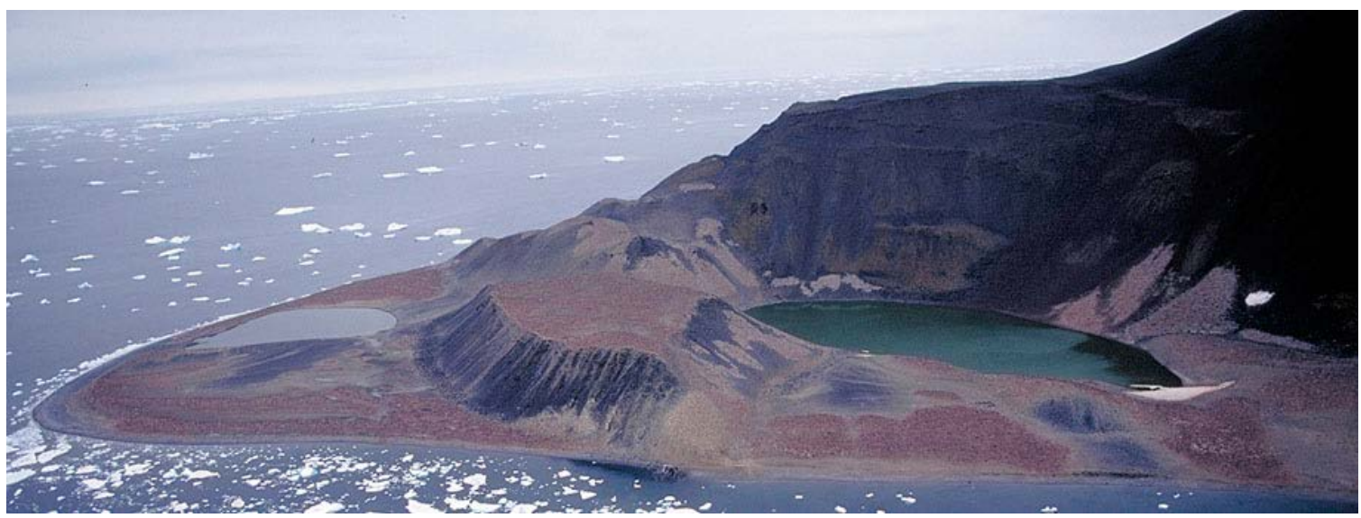
Paulet Island from above