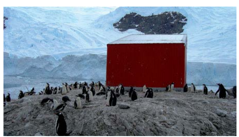
The refuge hut is slightly elevated above the beach, and often surrounded by nesting penguins.