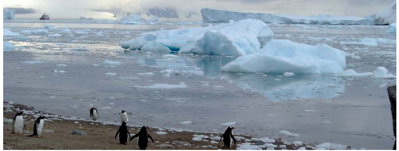
Neko Harbour landing beach

Be aware that glacier calving may produce dangerous waves. Avoid the beach or be prepared to evacuate quickly up the hill. The route to the higher rocky outcrop skirts areas which are heavily crevassed and extremely dangerous.