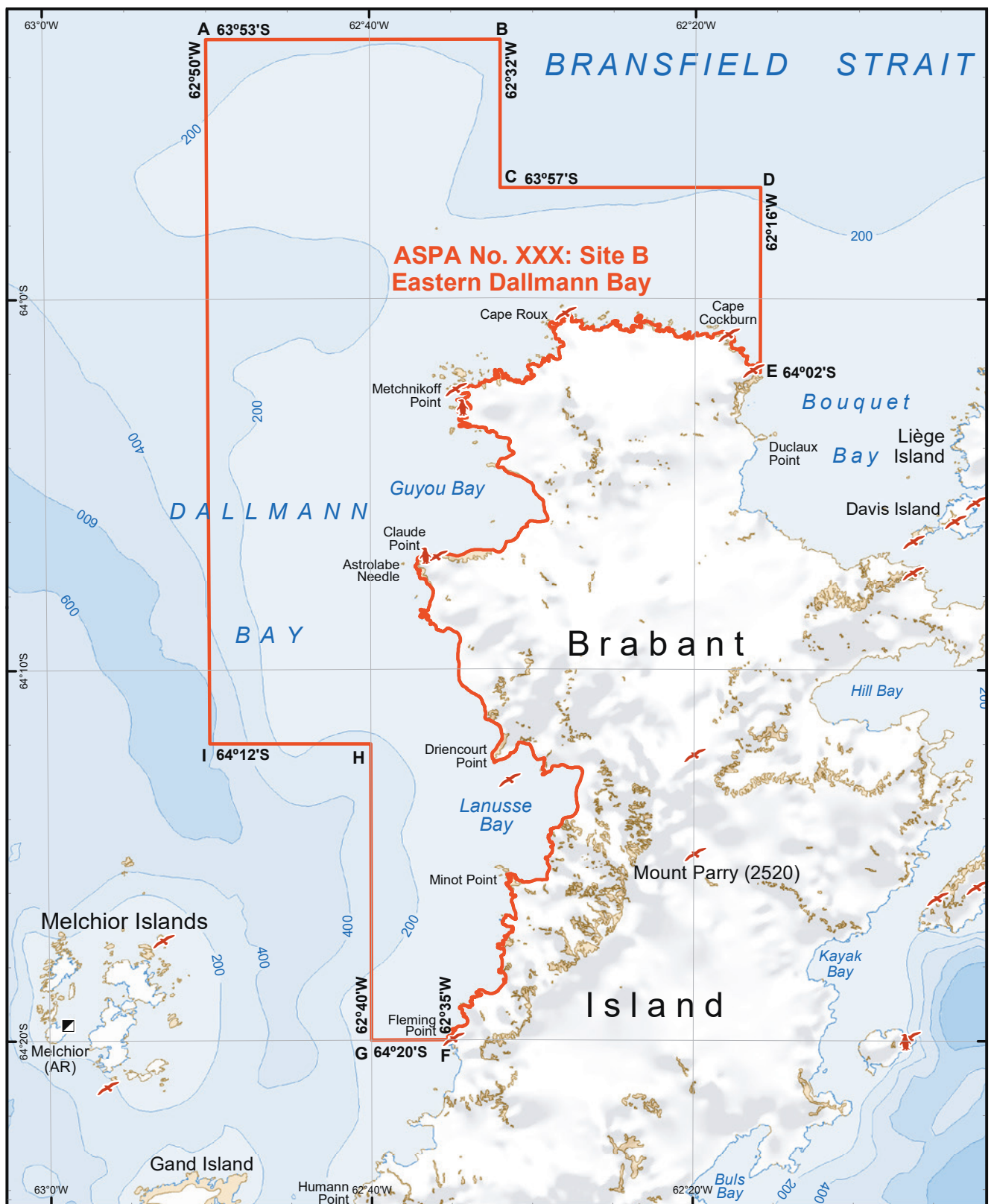
Map 3: ASPA No. XXX - Site B Eastern Dallmann Bay

02 Apr 2022 (v4.0) United States Antarctic Program Environmental Research & Assessment