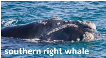
southern right whale

Do you enjoy wildlife photography? Scientists need your help. Join Happywhale in collecting sightings so we can track and learn more about these amazing creatures. It's simple. Take photos of: humpback, blue, fin, sei, southern right, killer whales, any rare whales, leopard and Weddell seals, as well as Antarctic shags at Base Brown. Upload your photos at happywhale.com We'll tell you what we find and share the data with scientists. Participating is as easy as 1-2-3: