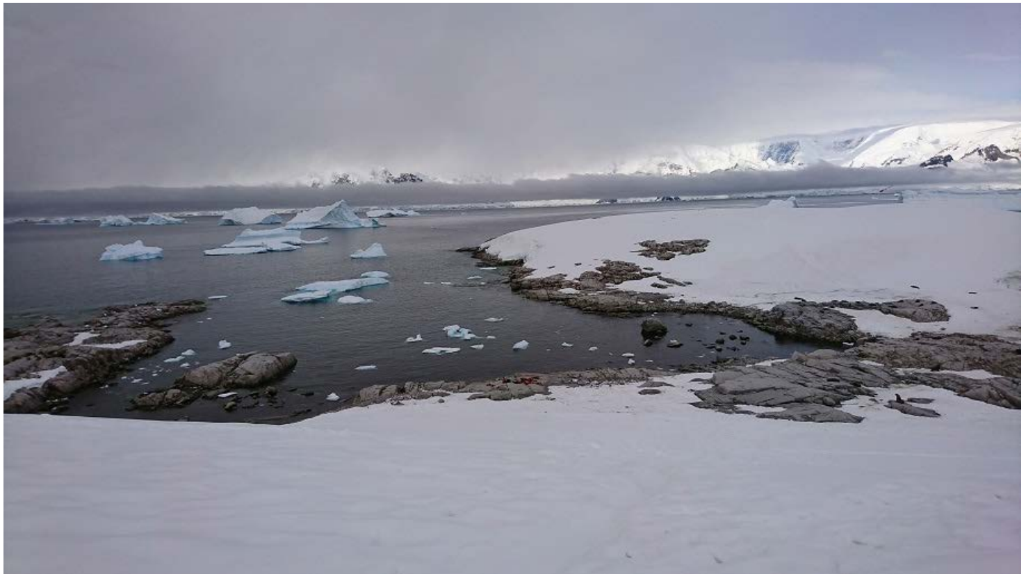
Primary landing site