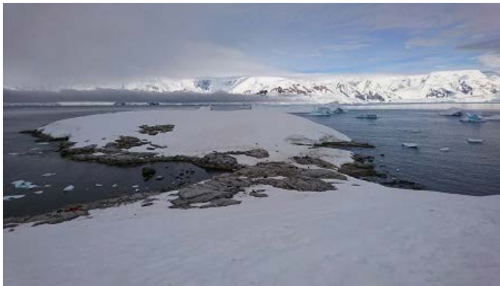
Alternative landing site