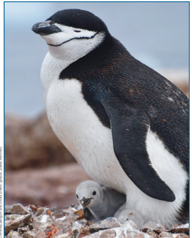
Chinstrap penguin and chick

In the first year of launch, Penguin Watch had over two and a half million hits, processing nearly half a million images and counting over 50 million penguins! Over 10 million images have now been classified, and some of this information is being used to train an automatic recognition tool. Some of the evidence produced helped create and design the South Georgia and South Sandwich Marine Protected Area in 2013, then the largest MPA in the world, and helped increase the area of protection around the South Sandwich Islands in 2018. The techniques associated with this project have also been spun out to other places around the world like the Arctic, Scotland, Gibraltar, Ascension Island, Montserrat and Argentina and to other species such as polar bears, seals, guillemots and kittiwakes.