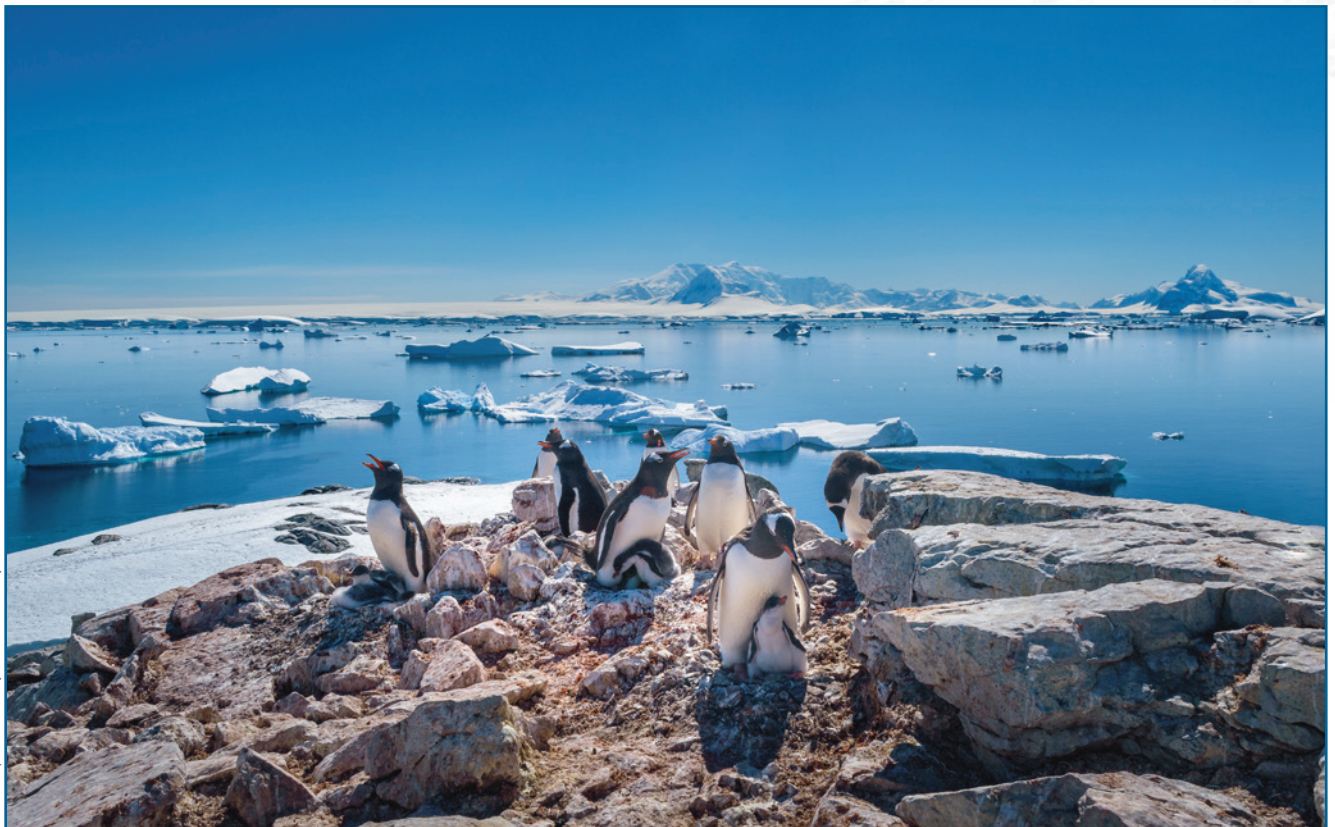
Gentoo colony on Booth Island

Help researchers identify penguin adults, chicks and eggs in photos taken in Antarctica and sub-Antarctica by time-lapse cameras for the benefit of penguin research and conservation. Penguin Watch is a research project initiated at the University of Oxford and hosted at Oxford Brookes University. Researchers are crowdsourcing image processing, with global implications for penguin management.