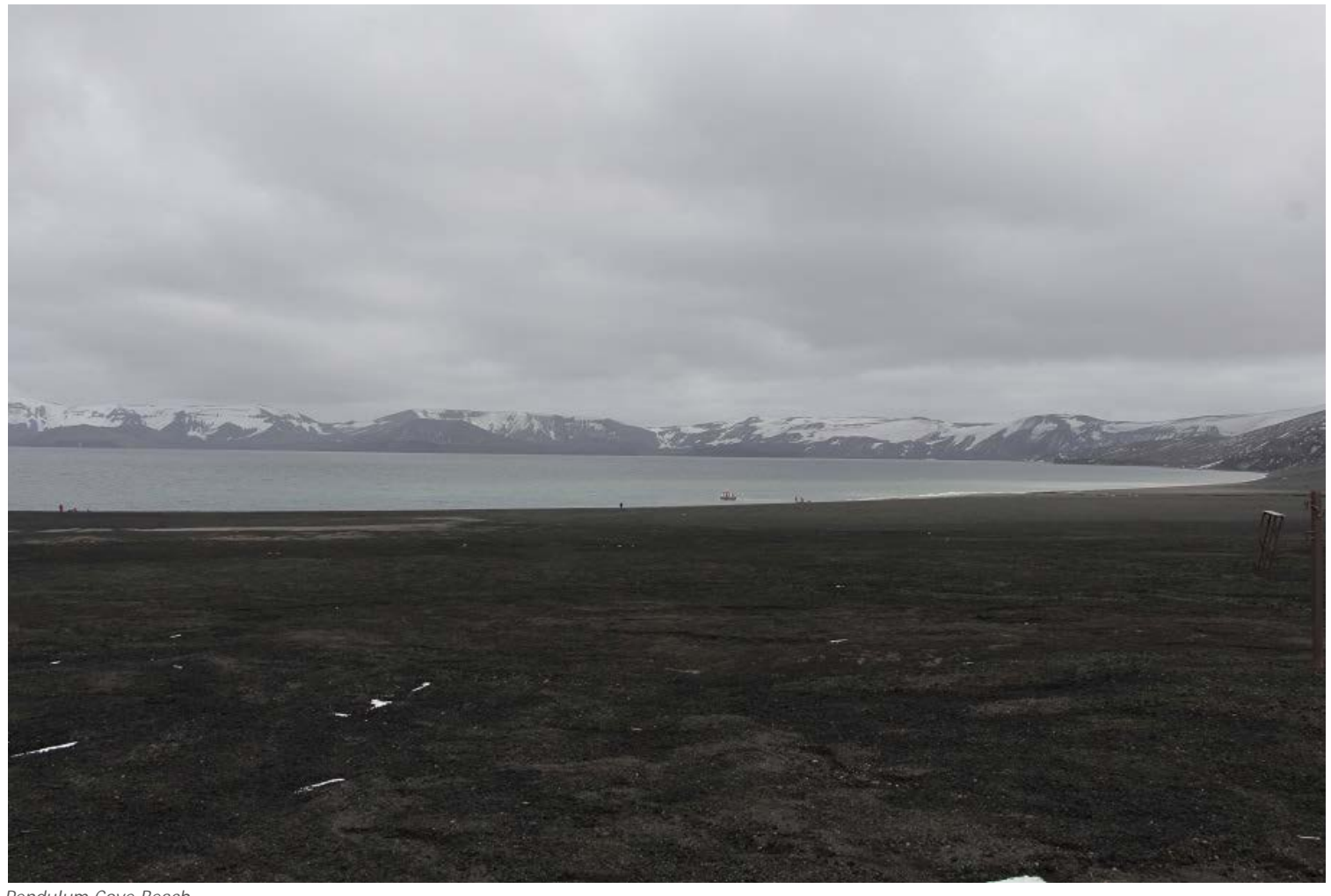
Pendulum Cove Beach