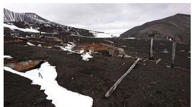
HSM 76 Aguirre Cerda Station ruins