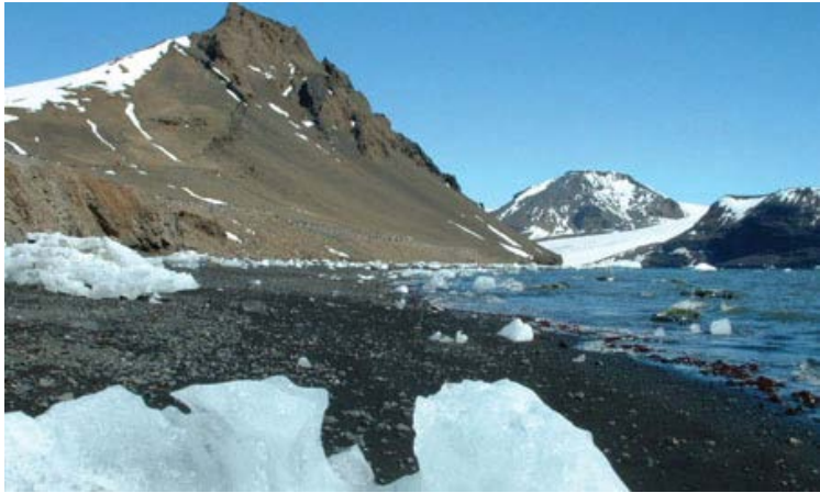
Landing beach at low water